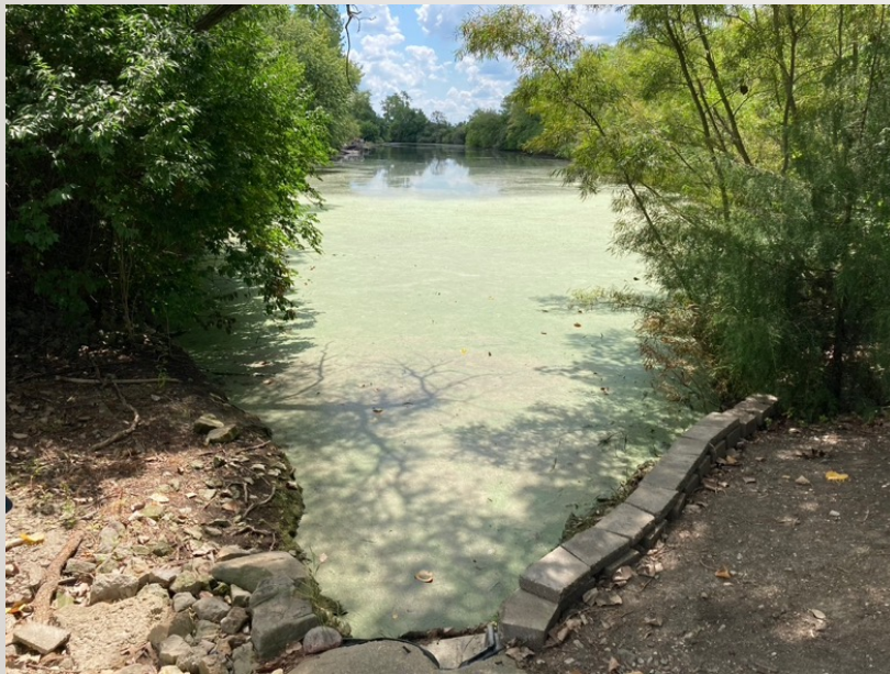
Commons behind 719 & 801 Erin Dr