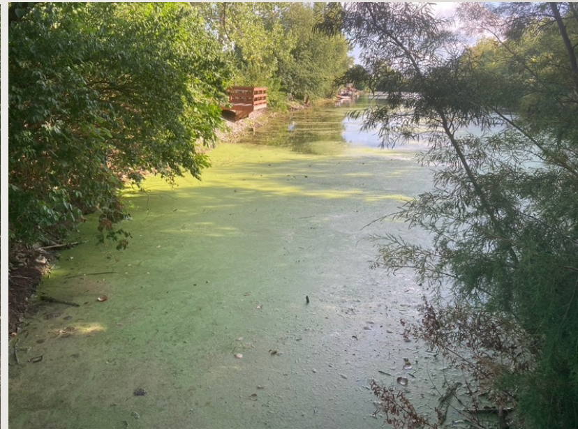
Commons behind 719 & 801 Erin Dr